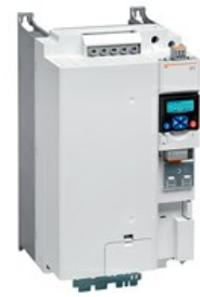
Variable speed drives VLB3